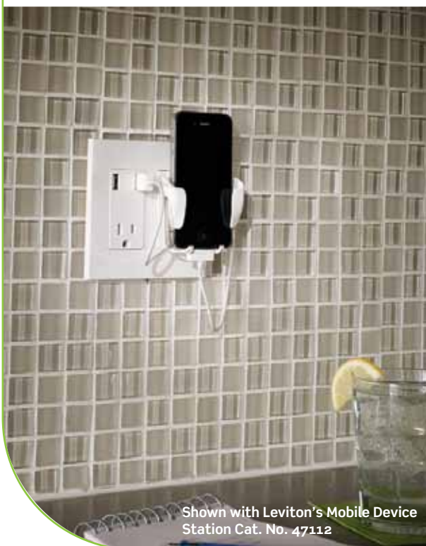
Shown with Leviton's Mobile Device Station Cat. No. 47112